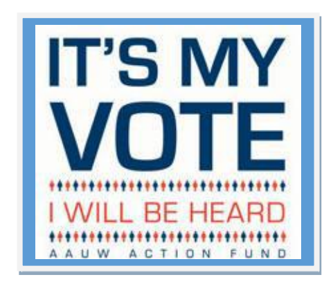
When Women Vote, We Change the Conversation!

In addition to electing a new President of the United States, we are electing Senators and Members of Congress to represent us. With so much at stake, it's more important than ever to identify those candidates who would best represent our values and those who would roll back our rights.